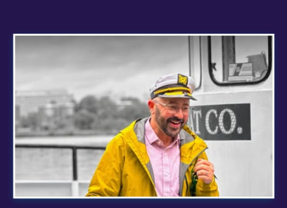
CURA began the year with a cruise on the Charles River.