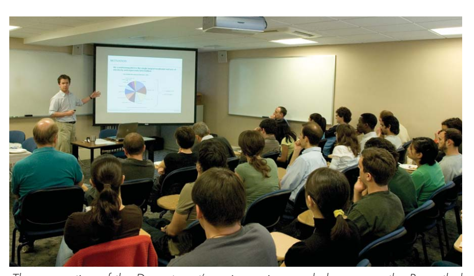
The renovation of the Department's main seminar and class room, the Rosenthal Room, was made possible by the gifts of donors.