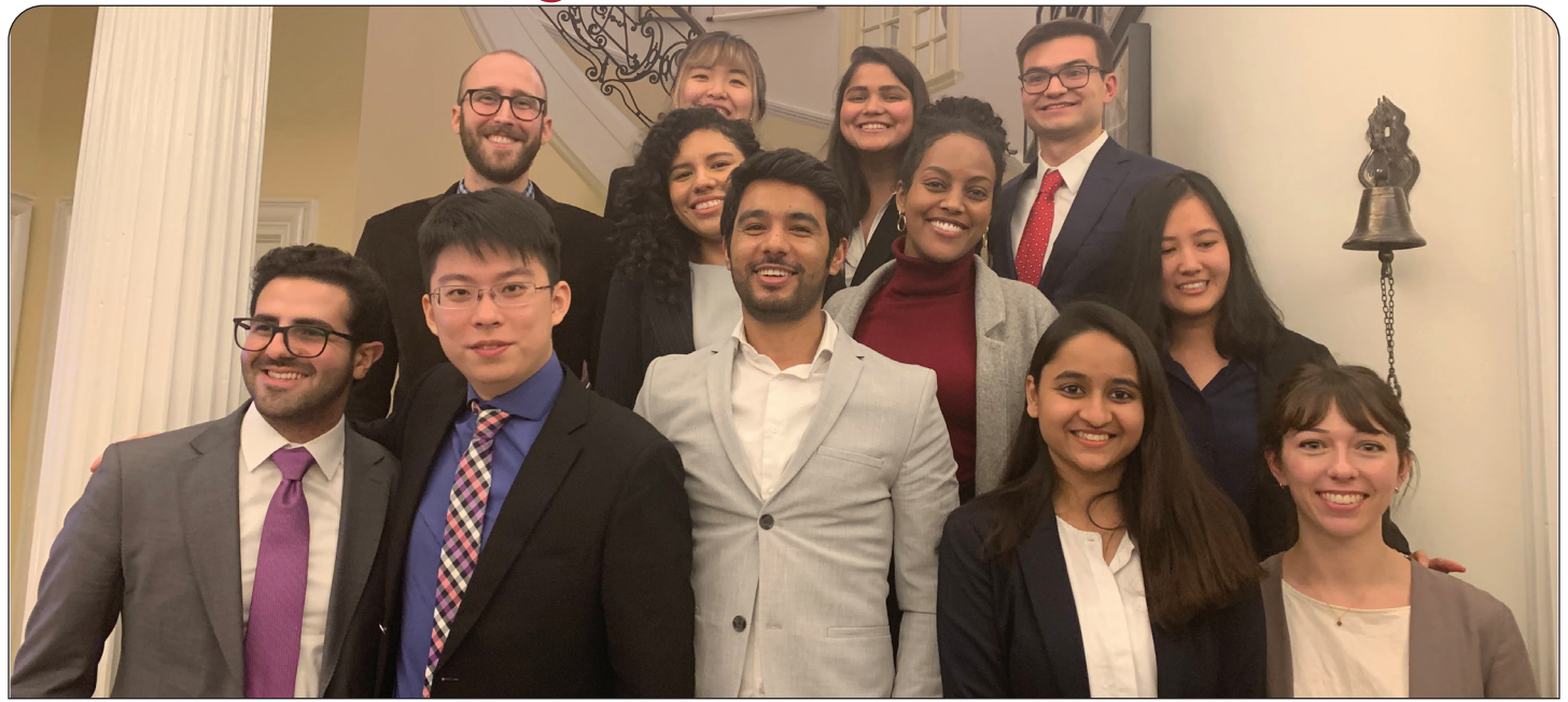
Students in the MA in Global Development Economics program presented their capstone projects: 'Economic Development in Peru' and 'The Impact of Psychosocial Education Programs for children in Refugee Camps', at the Global Development Capstone Showcase co-hosted by BU's Institute for Economic Development and Global Development Policy Center.