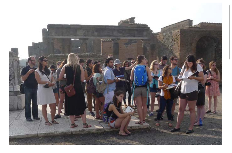
Tour of Pompeii with class in the Architecture in Rome program, October 2013

from the great people I get to work with. And moving between the different types of formats and classes is another challenge. But I have to say that I do appreciate having the opportunity to teach different types of classes. And the last thing I would say is a challenge as a teacher is to continue to learn. I always like to tell this story—it wasn't at BU, which is a good thing—but at another place I was before there was a professor who used to have slide carousels loaded with slides, and he would just blow the dust off them and insert them into the slide projector. So you don't want to feel like you're just delivering the same thing over and over again. I honestly feel like it takes doing a class at least ten times before you feel like you have confidence, and by that point you have to be careful about burnout. And that's not easy to do. It's a lot of work, and of course you're going to fall back on your tried methods. So I'd say constantly try to experiment and not be afraid to risk something, and it doesn't matter because at least you tried it. Keep taking risks and making changes to the material that you teach.