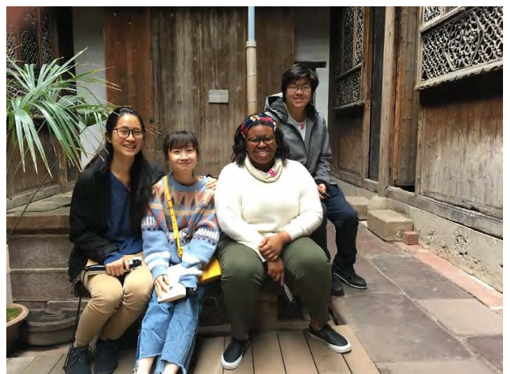
Students visit the Yin Yu Tang Chinese House at the Peabody Essex Museum.