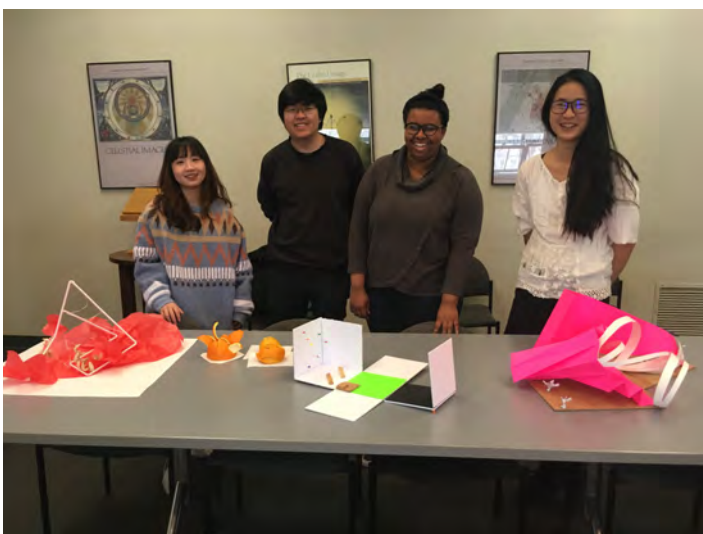
Students of the capstone course present their designs.