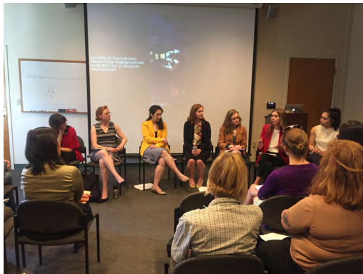
The 2018 MA graduates answer questions after presenting at the HAA annual MA Paper symposium.