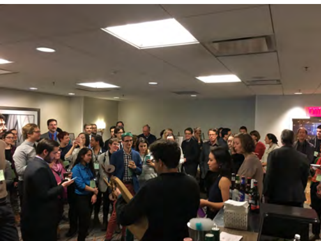
The BU History of Art & Architecture, Classics, and Archaeology departments co-sponsored an event at the Archaeological Institute of America this year including the exhibition, "Black Classicists" and a musical troupe playing classical instruments and music.