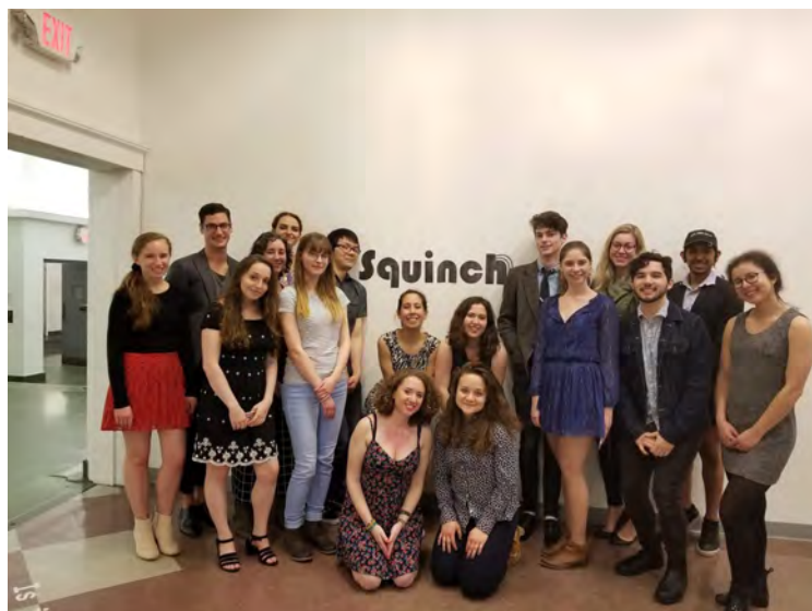
The full Squinch staff surround the co-founders at their inaugural print issue launch event held on April 27th at the BU Art Gallery in The Faye G., Jo, and James Stone Gallery.