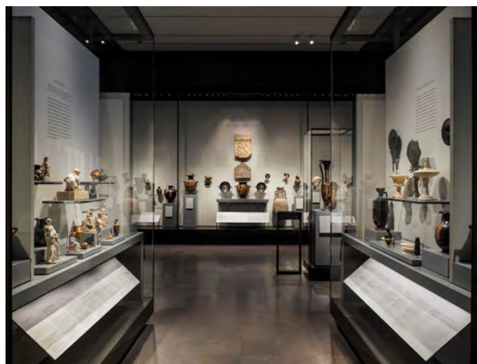
From a SEQUITUR research spotlight, the installation of the Daily Life in Ancient Greece Gallery at the Museum of Fine Arts, Boston, 2017.