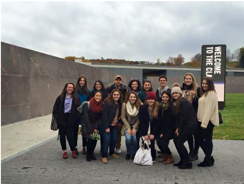
The Art History Association poses in front of the Clark Institute in Williamstown, Massachusetts.

This year, the BU Art History Association (AHA) remained busy, organizing trips to the Peabody Essex Museum, the Clark, and the Harvard Art Museums, just to name a few. AHA immerses undergraduate students in the art world of Boston and its surroundings. The members even organized a succulent sale this year to help fund AHA. The group consistently finds creative way to engage and involve their members in the art community!