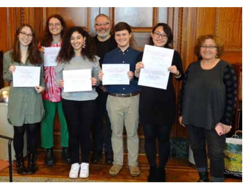
JEWISH STUDIES MINOR CELEBRATION