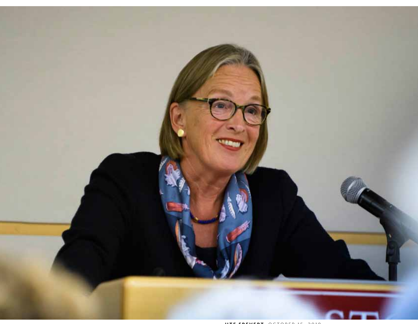
UTE FREVERT, OCTOBER 15, 2018 "NOVEMBER 9, 1938: EMOTIONS AND EMOTIONAL POLITICS THEN AND NOW, AND IN-BETWEEN"