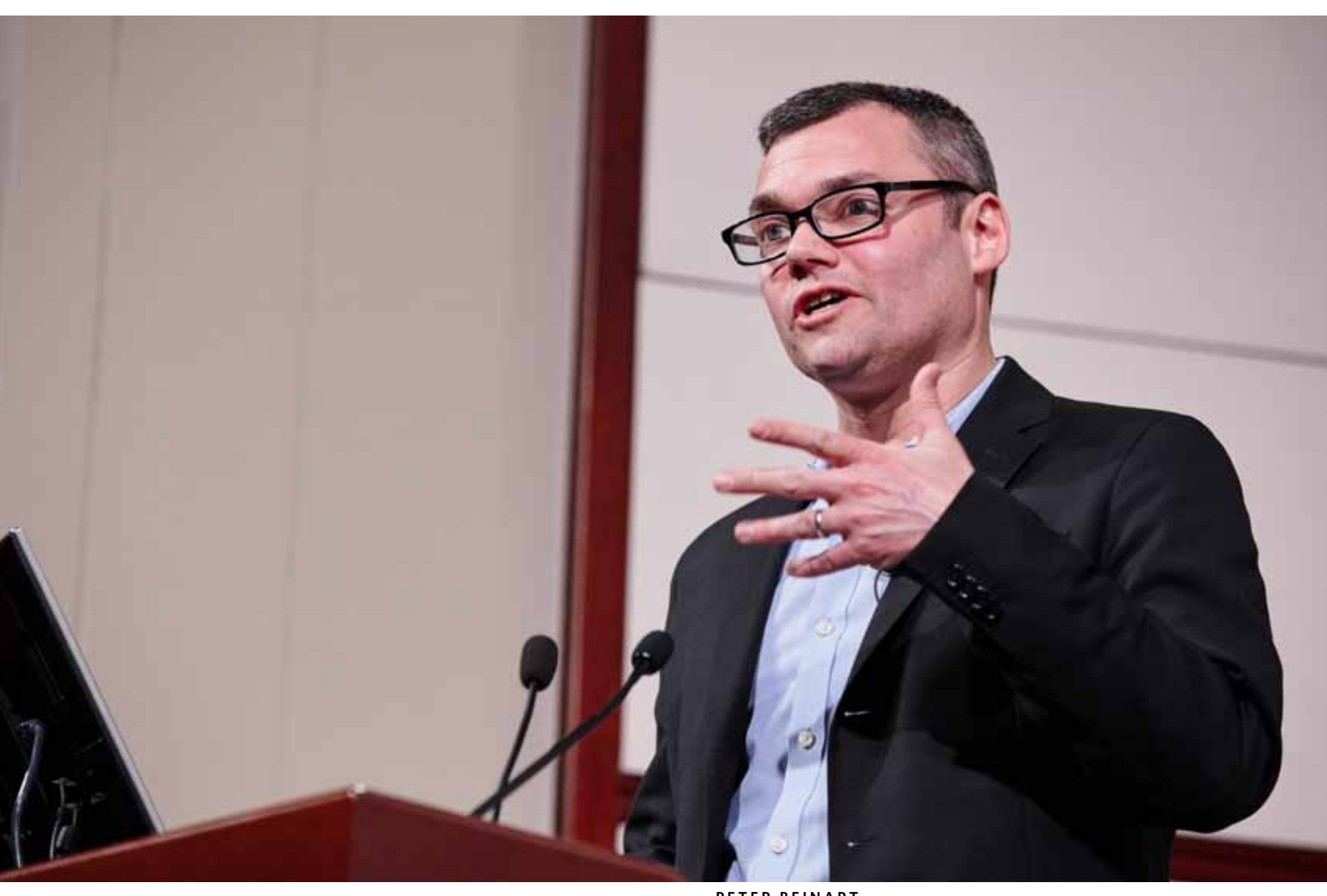
PETER BEINART THE 2019 YITZHAK RABIN MEMORIAL LECTURE APRIL 11, 2019