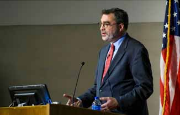
ELIE WIESEL MEMORIAL LECTURE, NOVEMBER 15, 2018