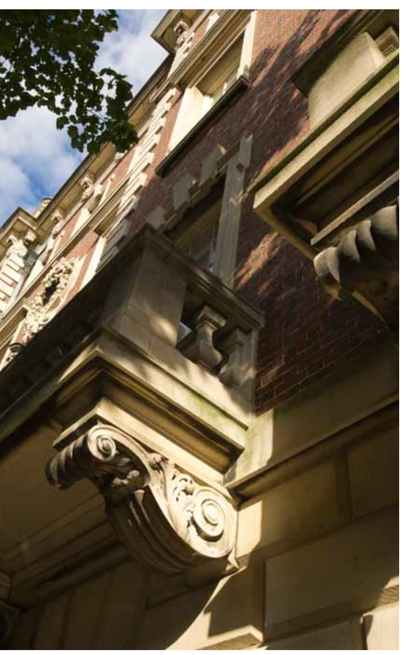
BEIT SHLOMOH V'SARAH WIESEL, 147 BAY STATE ROAD; SILBER WAY BALCONY.