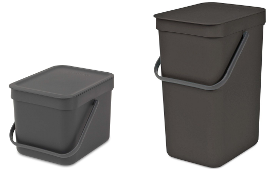
Brabantia 6 and 12 Liter Bins