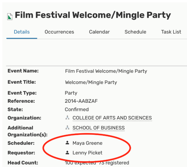
Image: Contact names appear in the details of objects throughout 25Live.