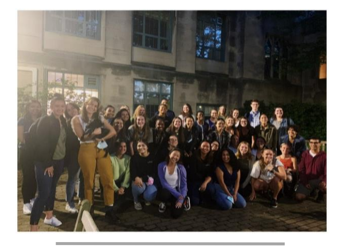
OTD students and faculty members during the first in-person Diverse-OT Picnic in September 2021.

who share a common interest in occupational therapy as an avenue for making a positive difference in the world.