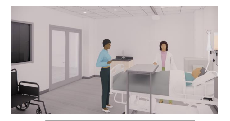
In this simulation, a student engages in a clinical intervention with trained actors and medical equipment while instructors monitor from the control room.

The simulation lab is expected to launch in Fall 2022. The lab is slated to be utilized for a number of OT classes such as Functional Movement, Skills 1 and 2, OBP and Level I Fieldwork. However, there are many other possibilities, including faculty research projects and extra-curricular activities, which will be shared by all graduate students at Sargent College.