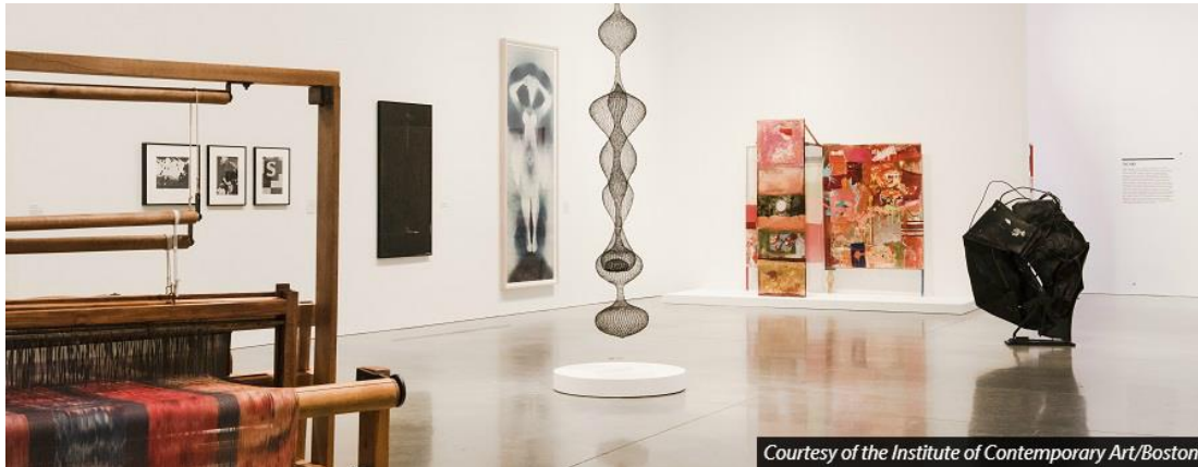
A gallery featuring a variety of mediums.

Leap Before You Look: Black Mountain College, 1933–1957 Institute of Contemporary Art, Boston October 10, 2015 – January 24, 2016