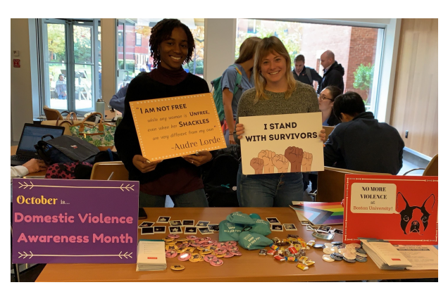
Two Prevention Educators tabling during Domestic Violence Awareness Month - October 2019