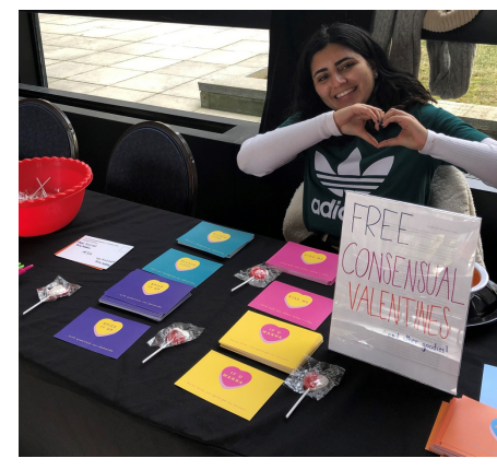
A SARP Ambassador handing our consensual valentine post cards In Februrary 2020