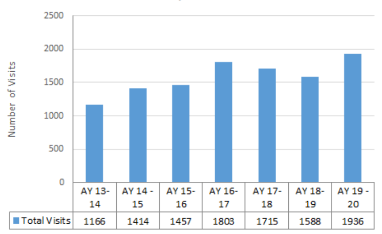
New Clients Served by Academic Year